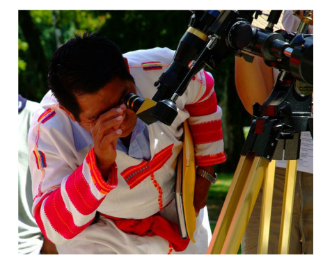
Maya official from the town of Oxchuc, Chiapas, attired in traditional dress from his town, observes the Sun through a special telescope.