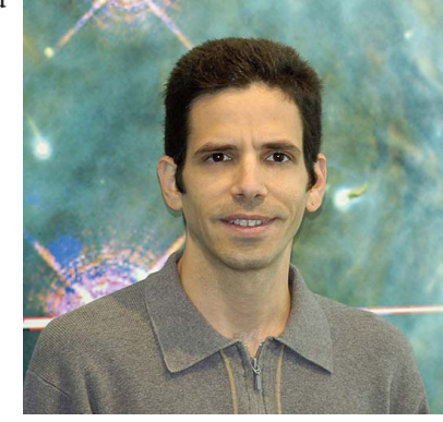
Jose Francisco Salgado

Who are the Black Astronomers and Astrophysicists? (profiles of 20<sup>th</sup> and 21<sup>st</sup> century African-American astronomers): http://womeninastronomy.blogspot.com/2015/01/women-of-color-in-astronomy-and.html